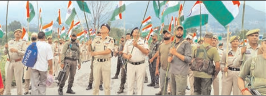
Police personnel along with others during Tiranga rally at Poonch.