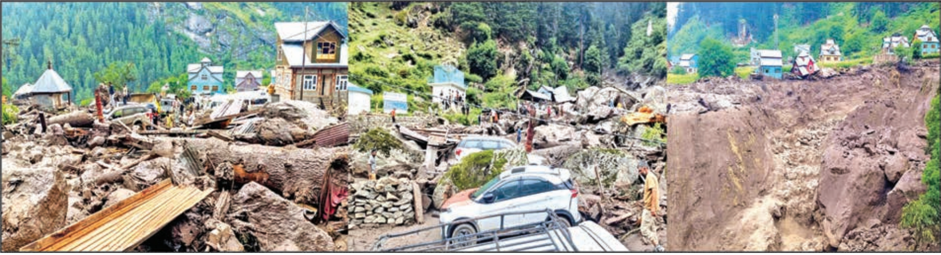
Cloudburst wreaks havoc in Kishtwar on Thursday, triggers flash floods; search and rescue ops underway. (More pics on pg-9)