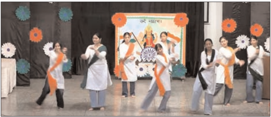
Students performing patriotic item.

■ STATE TIMES NEWS JAMMU: Presentation Convent Sr. Sec. School celebrated 79th Independence Day on its eve with great patriotic fervour and enthusiasm in the school auditorium. The event was graced by Sisters and two special guests hailing from the Armed Forces. The celebration commenced with a vivid description by students who took the audience on a journey through the pre-independence era. Through eloquent narration, they highlighted the struggles and sacrifices that paved the way for India's freedom. The programme featured colourful cultural performances including Prayer Song, patriotic songs, energetic dances and a captivating three-act play. The opening ceremony portrayed the evolution of India's National