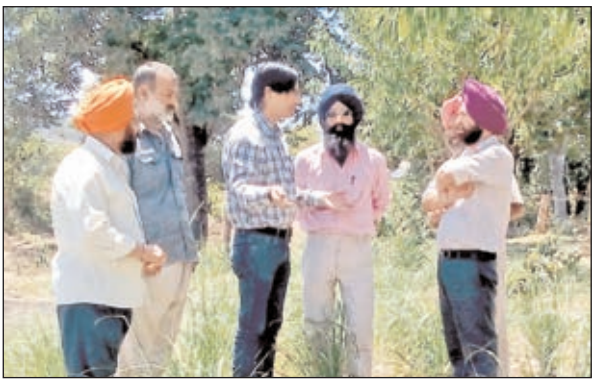
KVK scientist educating farmers.