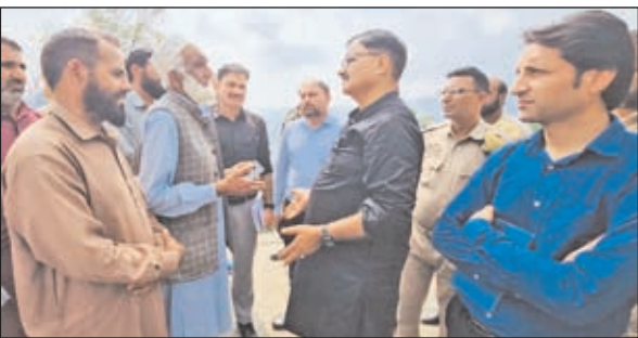
Cabinet Minister Javed Ahmed Rana interacting with locals.

■ STATE TIMES NEWS POONCH: Minister for Jal Shakti, Forest, Ecology & Environment and Tribal Affairs, Javed Ahmed Rana, today undertook a comprehensive tour of landslide-affected areas of Surankote and Mendhar subdivisions of Poonch district. The visit was held with an aim to assess on-ground damage, oversee restoration efforts and ensure immediate relief and rehabilitation measures for affected communities. Accompanied by senior officials of the District Administration and engineers from line departments, the Minister conducted site visits along the Surankote-