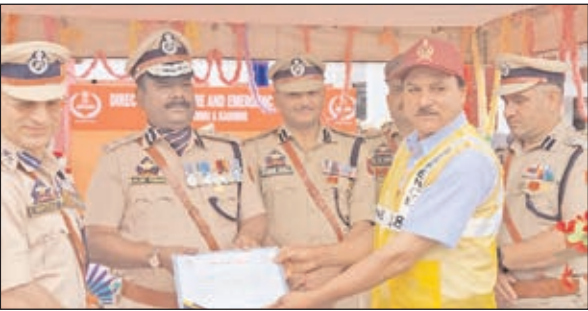
A CD volunteer being given certificate.

■ STATE TIMES NEWS SRINAGAR: On the occasion of Independence Day-2025, Alok Kumar, Commandant General Homeguards, Civil Defence & SDRF J&K granted commendation certificates along with cash reward in favour of Civil Defence Wardens/ volunteers for outstanding performance during day to day Civil Defence activities and exigencies arising from time to time in their respective districts/ towns. The commendation certificates were distributed among these Wardens/ Volunteers by the Commandant General during a function organized for celebration of Independence Day at Srinagar which was attended among others by Director HG