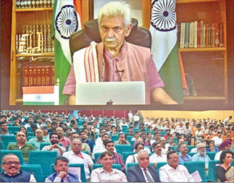
LG Manoj Sinha delivering inaugural address at 22nd Foundation Day of Shri Mata Vaishno Devi University on Tuesday.