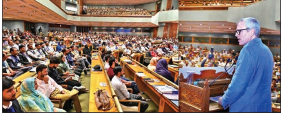
CM Omar Abdullah addressing Educational Stakeholders Meet on NEP at SKICC.