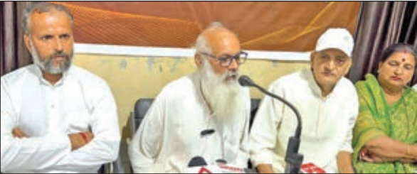
Shri Yog Vedant Sewa Samiti Bhagwati Nagar Jammu member talking to reporters.

Shri Yog Vedant Sewa Samiti Bhagwati Nagar Jammu members stated that it holds complete documentation of the land allotted by JDA and regularly maintains and repairs the boundaries, planting medicinal plants and fodder for its Gaushala cows. Officials were reportedly informed of illegal encroachments by land mafias six months ago, and the JDA Tehsildar, along with Patwari and other officials, had visited the site at that time.