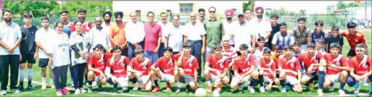
Participating teams posing for a photograph with dignitaries.