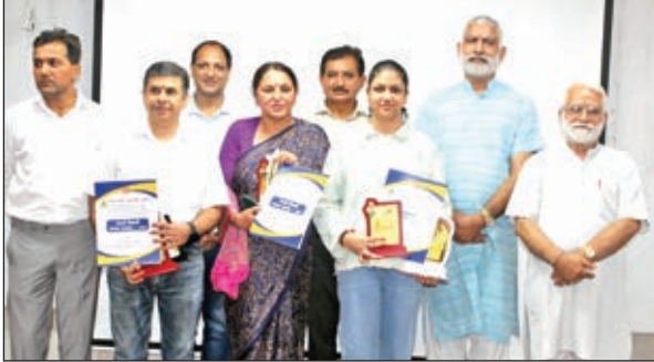
Vidya Bharti Jammu Kashmir & Ladakh members and student at felicitation programme.

In his inspiring address to the students, he congratulated them on their achievements and urged them to become responsible citizens by following five key values: Respect your elders, remember your parents and locality, honour your teach-