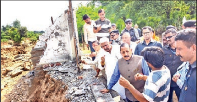
Union Minister Dr. Jitendra Singh visiting the site of cloudburst sites and taking stock of the relief work at Kathua on Friday.

The affected families expressed trust and appreciation for Dr Singh's presence as their public representative. On-the-spot directions were issued to restore electricity and water supply by evening and to ensure adequate medical and sanitation facilities to prevent outbreaks in the calamity-hit zones.