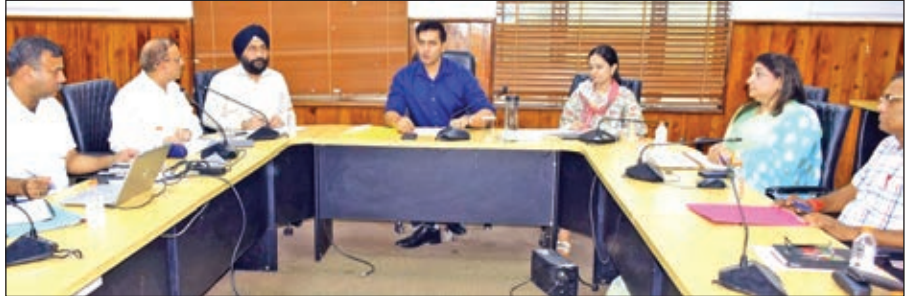
DC Jammu Dr Rakesh Minhas reviewing functioning of School Education Department.

The Deputy Commissioner laid special emphasis on strengthening basic school infrastructure, stating that quality education is directly linked to the availability of proper physical facilities. He directed immediate focus on construction of adequate classrooms to meet enrolment needs, provision of separate toilets for boys and girls in all schools, development of playgrounds for the