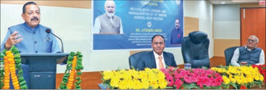
Union Minister Dr. Jitendra Singh addressing gathering after releasing the latest edition of the RTI Journal at CIC Bhawan, New Delhi on Tuesday.

Highlighting some of the landmark DoPT (Department of Personnel & Training) reforms since 2014, Dr. JitendraSingh recalled the abolition of over 1600 obsolete rules, starting