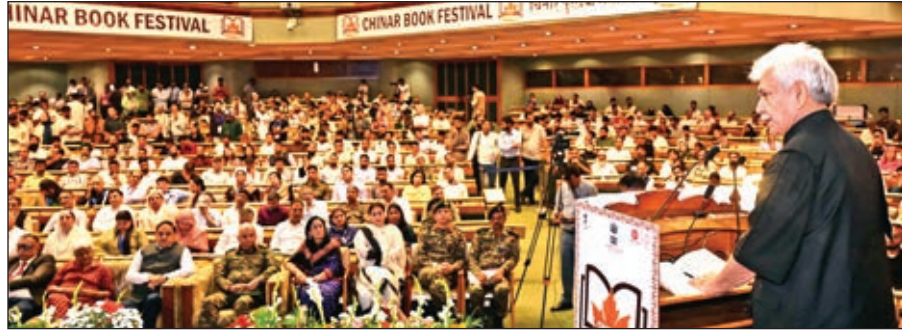
LG Manoj Sinha speaking at the Chinar Book Festival at Srinagar on Saturday.

"The books open the window to the world. Books offer new ideas and fresh perspectives that change the way we perceive things and promote critical thinking. Chinar Book Festival will connect the new generation to our precious literary heritage