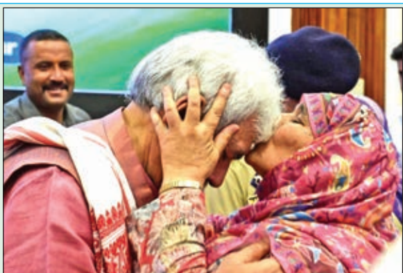
A Symbol of Justice and Compassion in Srinagar

► For more than three decades, the terror state Pakistan is shedding innocent blood through its proxy terrorist outfits. Time did not erase the pain of loss. Invisible scars on their soul can be felt and the mute eyes are witness to many unfulfilled dreams ► I assure family members of civilian martyrs that I will not rest until every family that has been a victim of the terrorists' atrocities gets justice ► Because of Article 370, terrorism increased and the terror ecosystem was emboldened. On 5 August 2019, dismantling of terror ecosystem had begun