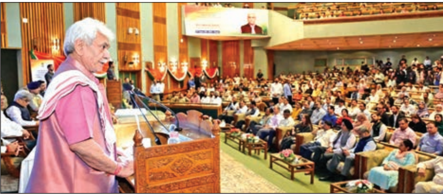
LG Manoj Sinha speaking during a programme at Srinagar on Tuesday.

■ STATE TIMES NEWS SRINAGAR: Lieutenant Governor Manoj Sinha on Tuesday handed over the appointment letters to 158 Next of Kins (NoKs) of Kashmiri Civilians killed by Pakistan-backed terrorists. The families of terror victims narrated their traumatic experiences. They exposed the injustice perpetrated by Pakistan-sponsored