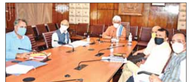
LG Manoj Sinha e-inaugurating Online Process-Based Career Education Platform at Srinagar.

STATE TIMES NEWS SRINAGAR: Lieutenant Governor Manoj Sinha on Tuesday e-inaugurated an online process-based, standardised and scalable career education platform for students here.