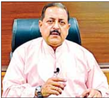
Union Minister Dr Jitendra Singh briefing about important reforms brought in by the Department of Pension and Pensioners' Welfare, at New Delhi.

Disclosing this while briefing the media about some of the important reforms brought in by the Department of Pension and Pensioners' Welfare, Union Minister of State (Independent Charge) Development of North Eastern Region (DoNER), MoS PMO, Dr Jitendra Singh said that the earlier Rule provided for payment of family pension to a divorced daughter only if the divorce had taken place during the