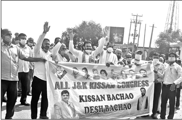
Members of All J&K Kissan Congress staging protest at Samba.