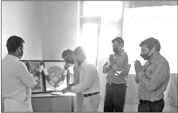
Dignitaries lighting ceremonial lamp.