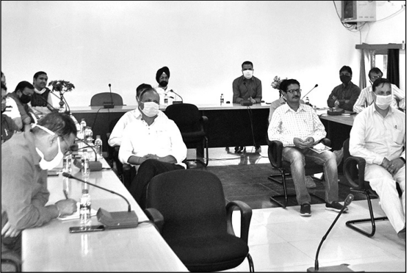
Dulhasti officials during the programme at Kishtwar.

■ STATE TIMES NEWS KISHTWAR: The four-day online training program on the topic "Yoga and Health" organized by Dulhasti Power Station through the Yog Manav Vikas Trust, Banikhet, District Chambha (HP) concluded on