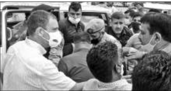
Congress leader Rahul Gandhi being welcomed at Nagrota.

and not fulfilling the promises made to the electorate during the 2014 Assembly elections, said people now forget the BJP and decided to bring back Congress party leadership in J&K UT as well as central levels.