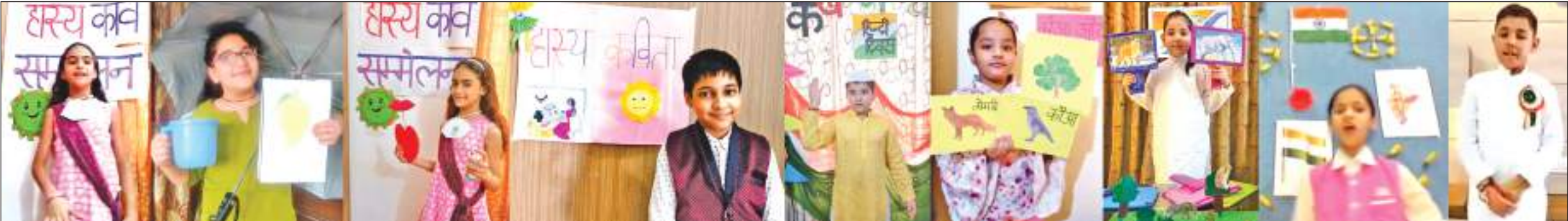
Students of JK Public School Kunjwani presenting various activities during virtually celebration of Hindi Diwas.

■ STATE TIMES NEWS JAMMU: Every year September 14 is celebrated as 'Hindi Diwas.' On this day in 1950, the Constituent Assembly of India had adopted Hindi, an Indo-Aryan language written in Devanagari script as one of the official languages of the Republic of India. The day is dedicated to promote and propagate the language Hindi. To recall and showcase the importance of the language,