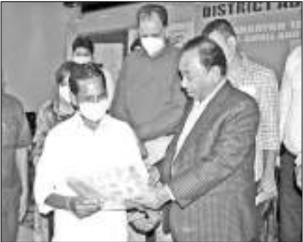
Union MSME Minister, Narayan Rane handing over certificate to a beneficiary.

■ STATE TIMES NEWS JAMMU: Minister of Micro, Small and Medium Enterprises, Narayan Rane on Wednesday visited district Samba under the ongoing public outreach programme of the Centre Government. Addressing the locals, the minister said that 80 percent of India's manufacturing industry belongs to Micro, Small & Medium Enterprises, which makes it vital for employment generation. "The need of the hour is to provide cutting edge technology to our industry to enable it to meet global competitors," he said. The Minister stressed on the need to manu-