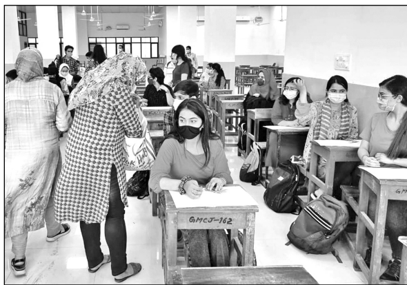
Students participating in poster-making competition.

in their own way to create awareness among public and among peers regarding drug safety by participating in poster making competition. Students will also take out Slogan March and Department of