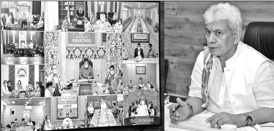
Lt Governor Manoj Sinha reviewing the COVID scenario in J&K.

J&K to get 20 lakh vaccination doses by Sept end