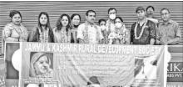
JKRDS members during a drive at Jammu.