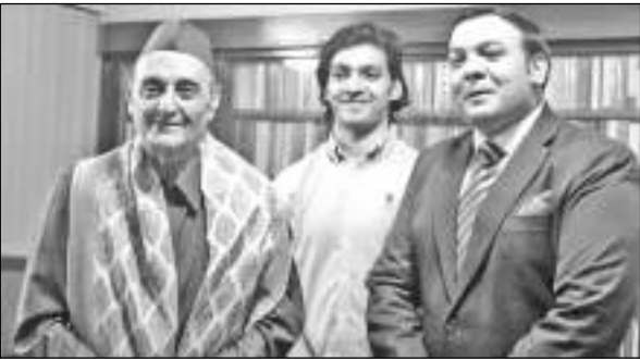
Former MP, Dr Karan Singh and others during a programme.

Highlights role of Dogras in Indian History