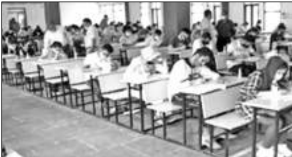
Students appearing in CET-2021 at Jammu.