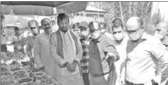
Union Minister for Food Processing Industries, Pashupati Kumar Paras visiting stalls at Baramulla.

stalls installed by horticulture and other related departments. These stalls, apart from presenting sponsored schemes and programmes displayed different fruit varieties that are locally grown in the region. The Minister also interacted with some progressive fruit growers of Pattan area during which they shared their feedback and farming experiences with the minister.