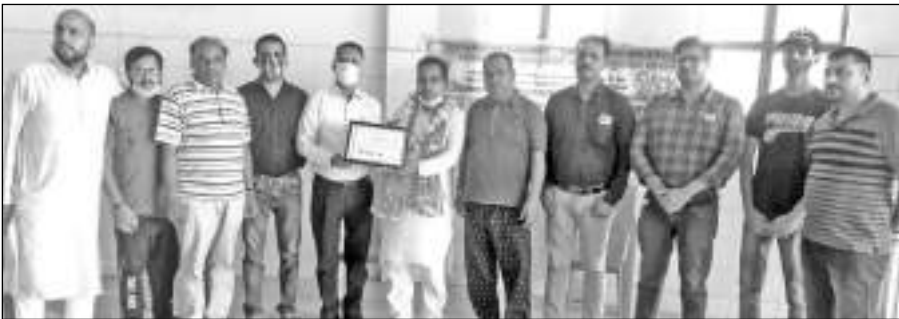
ABGGRF members during a meeting at Jammu on Sunday.