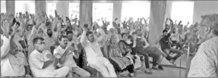
A participant speaking during Jat Mahasabha meet in Samba.