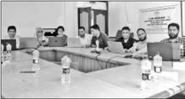
Officials during a workshop of SCERT.