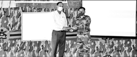
Army officer honouring a resource person.