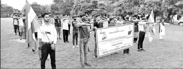
NYK volunteers taking pledge at Kathua.

KATHUA: As part of celebrations of Azadi Ka Amrut Mohatsav-India @75, NYK Kathua on Tuesday organised Fit India freedom Run at Village Manglore, Block Dinga Amb. Principal GHSS Manglore was Chief Guest on the occasion. Youth took pledge for 'fitness Ki dose 30 minutes Roz' and