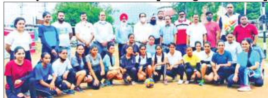
Volleyball teams posing with Chief Guest at Mini Stadium, Udhampur on Tuesday.