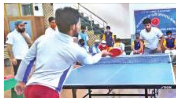
A table tennis match in progress.