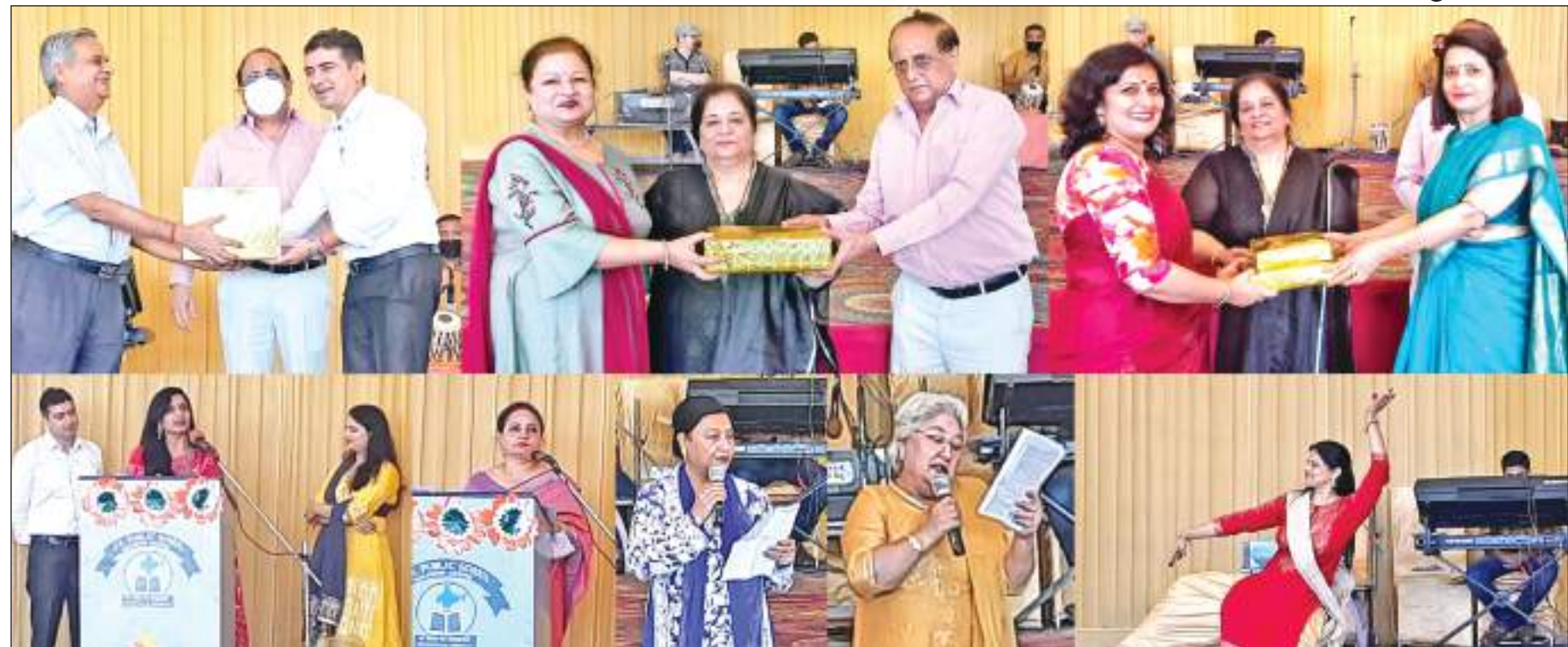
Management members of JK Educational Society felicitating staff on Teachers' Day while teachers presenting various activities.

■ STATE TIMES NEWS JAMMU: Management of JK Educational Society, as a gesture of benevolence and gratitude, appreciated the efforts of its teaching and non-teaching staff on