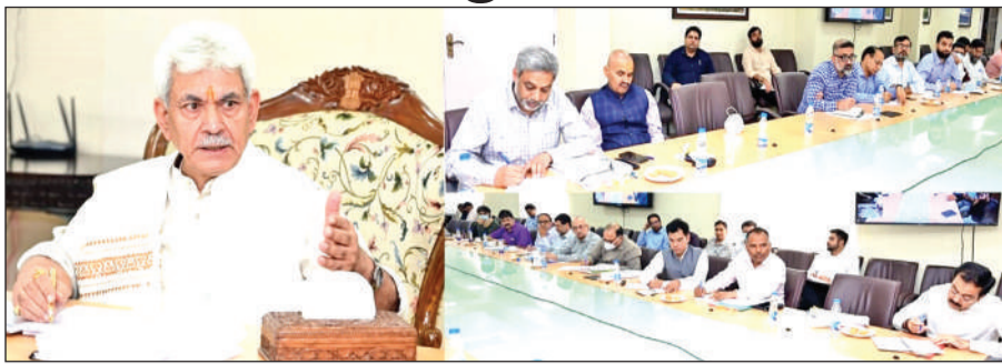
Lieutenant Governor Manoj Sinha chairing a meeting at Srinagar.

The Lt Governor was briefed about Aapki Zameen Aapki Nigrani; Digitization of Land Records; Change of Land Use; issuance of Land