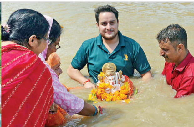
Devotees immersing idols of Lord Ganesha in River Tawi on the conclusion of ten days long Ganesh Utsav in Jammu.