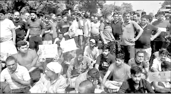
Locals staging protest at Udhampur.