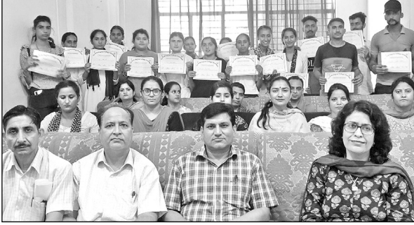
Faculty along with students during the event.

On the 1st day, faculty members were felicitated by the Principal of the college with the certificates of appreciation. The 2nd Day witnessed a variety Cultural programme and different games like musical chair, picking of slips, lemon race, skit on the role of teacher etc. for teachers. On Day 3 a Debate