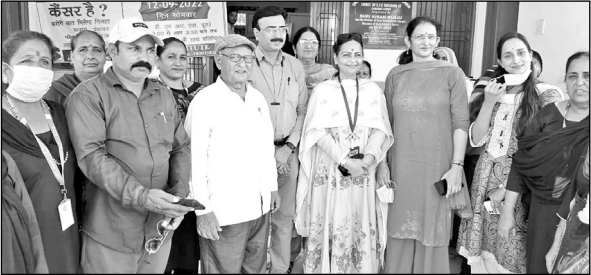
Doctors along with organisers during the camp.