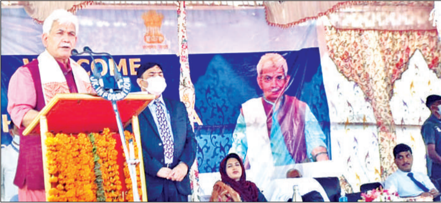
LG Manoj Sinha addressing public gathering at Poonch on Tuesday.

■ STATE TIMES NEWS POONCH: Lieutenant Governor Manoj Sinha on Tuesday asserted that no more sale of jobs will be allowed in Jammu and Kashmir.