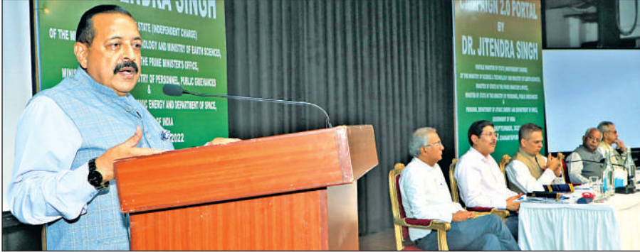
Union Minister Dr Jitendra Singh launching "Swachhta" Portal www.pgportal.gov.in/scdpm22 for Special Campaign 2.0, at New Delhi on Wednesday.

Dr Jitendra Singh said, as per the directions of Prime Minister Modi, the scope and mandate of Special Campaign 2.0 from 2nd October to 31st October, 2022 has been expended and