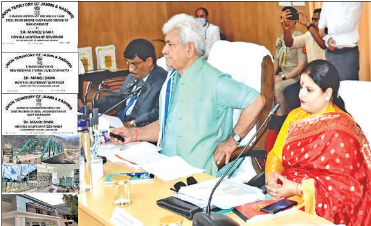
Lieutenant Governor Manoj Sinha laying foundation stone of projects worth Rs.56.03 Crores virtually during a meeting at Kishtwar on Wednesday.

While examining the progress of mega development projects and saturation of UT and Centrally Sponsored Schemes (CSS), the Lt Governor directed the executing agencies to ensure timely