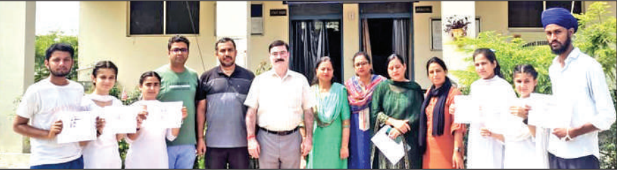
GDC Marh faculty members and students during Hindi Diwas celebration.