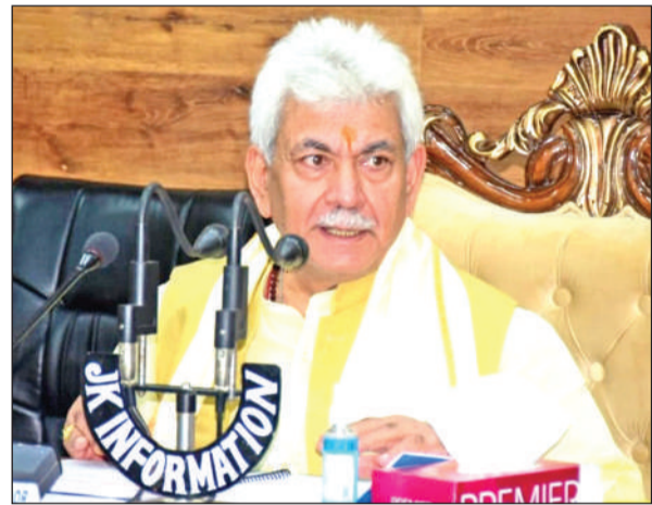
LG Manoj Sinha chairing District Development Review meeting at Doda on Thursday.

After Poonch and Kishtwar, this was the third District visit of the Lt Governor in three days.