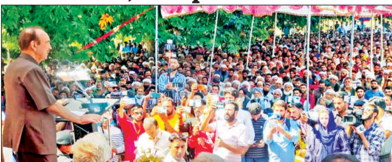
Former CM Ghulam Nabi Azad addressing public meeting at Srinagar on Thursday.

"I will say you will get freedom. But, you will not get it. Have you got it from