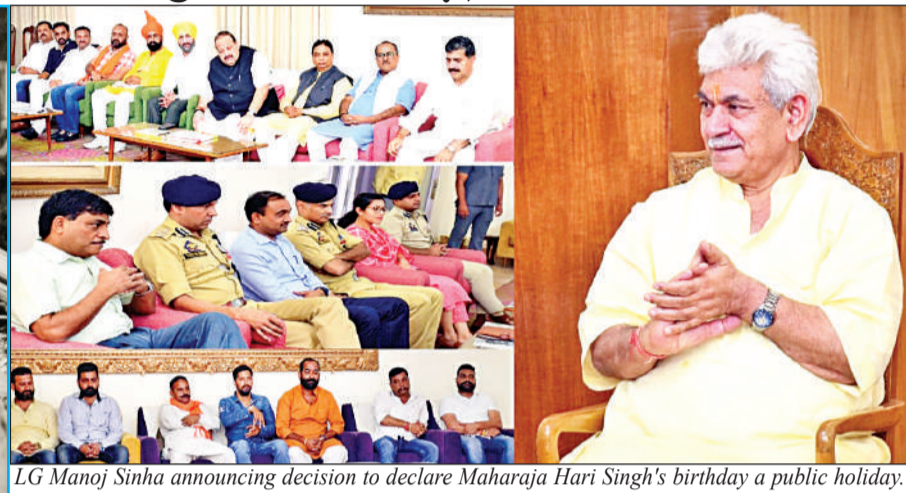
LG Manoj Sinha announcing decision to declare Maharaja Hari Singh's birthday a public holiday.