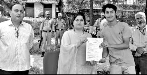
DC Babila Rakwal handing-over a certificate to an applicant.

■ STATE TIMES NEWS REASI: Deputy Commissioner, Reasi, Babila Rakwal visited Block Arnas and listened to public issues and demands during weekly Block Diwas programme held at Salal Kotli of District Reasi, the other day.