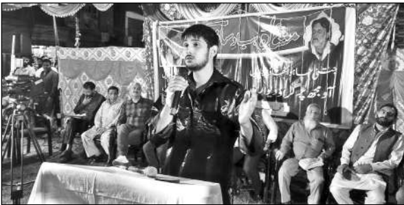
A poet reciting his verses during Mushaira.