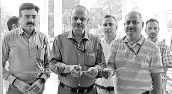
A dignitary inaugurating cancer screening camp at Kathua.