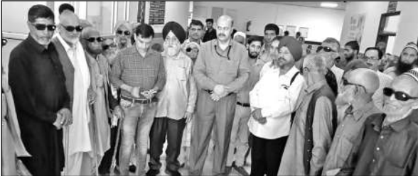
Members of PSF along with beneficiaries.