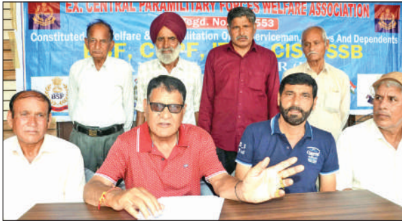
Members of Ex-CPMF Welfare Association talking to reporters.

"The service condition of paramilitary forces is regulated by a strong set of Acts with the provision to award punishment up to