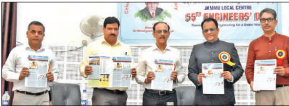
Members of IEI Jammu launching a booklet during Engineers' Day celebration.