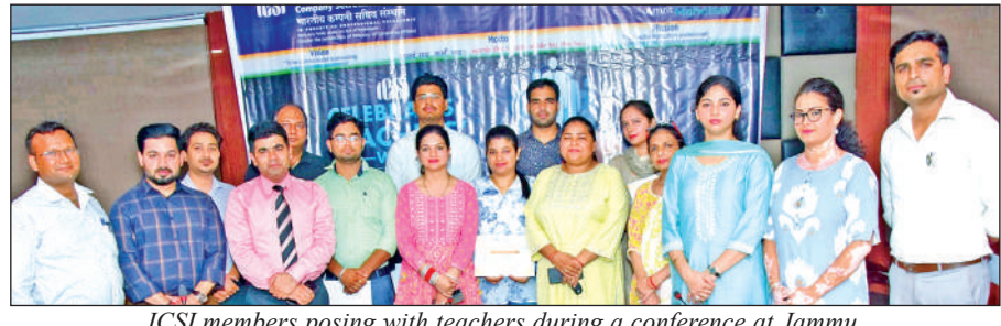
ICSI members posing with teachers during a conference at Jammu.