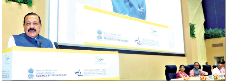
Union Minister Dr Jitendra Singh addressing young students and innovators after presenting ASPIRE StartUp awards, at Vigyan Bhawan, New Delhi on Friday.

Dr Jitendra said, during the year 2020-21, while the country like rest of the world was battling with the severe impact of COVID-19, the annual INSPIRE Awards - MANAK (Million Minds Augmenting National Aspiration and Knowledge) competition attracted an