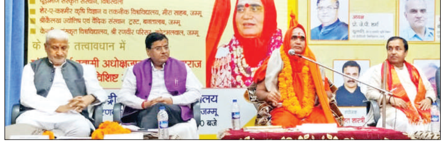
Swami Shankaracharya speaking at a programme in Jammu on Friday.