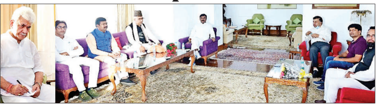
LG Manoj Sinha interacting with a delegation of BJP ST Morcha at Srinagar on Monday.

■ STATE TIMES NEWS SRINAGAR: Lieutenant Governor Manoj Sinha on Monday said that the Union Territory Government is working towards the inclusive and equitable development of Jammu and Kashmir keeping the welfare of all sections of the society on priority.