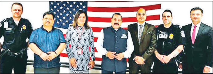
Union Minister Dr Jitendra Singh, as the head of Joint Ministerial Indian delegation, being received at New York on Tuesday evening, enroute Washington, on the first leg of 5-day US visit.

■ STATE TIMES NEWS NEW YORK: Union Minister, Dr Jitendra Singh, as the head of Joint Ministerial Indian delegation, arrived at New York this evening, enroute Washington DC, on the first leg of the 5-day US visit, which includes participation in Global Clean Energy Action Forum summit scheduled from September 21st to 23rd at Pittsburgh, Pennsylvania. Dr Jitendra was received by senior India Embassy officials and after facilitations at the airport, he left for Washington DC to hold an important Roundtable with senior executives of about 35 companies and federal representatives associated with Geospatial, Space, Earth & Ocean Science, Pharma and Biotech Sectors to be organized by US-India Business