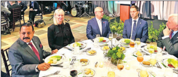
Union Minister Dr Jitendra Singh at the Dinner meeting at Heinz History Centre, Pittsburgh, Pennsylvania, US.