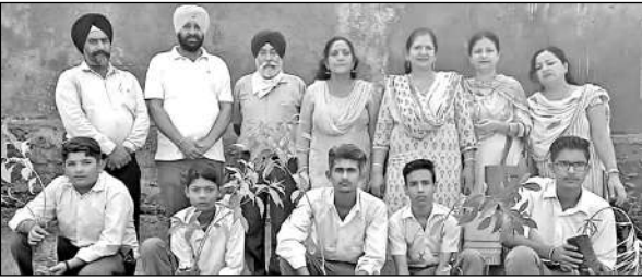
NGO members along with students during the drive.

■ STATE TIMES NEWS JAMMU: An open environmental workshop on solid waste management and a plantation drive were organized at Govt High school Gobind Singh Pura Simbal Morh Jammu on Thursday. The workshop was conducted to create awareness with regards to waste management, its re-uses and disposal making it income employment and hygienic generating movement as part of Environmental Awareness Campaign organized by J&K Rural Sprots Club a Regd NGO to spread the message through the medium of Educational, Sports and cultural activities.