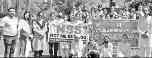
Students and others during cleanliness drive.

■ STATE TIMES NEWS UDHAMPUR: Students of Govt College for Women on Thursday carried out cleanliness drive in the Shaheed Bhagat Singh Park Udhampur under NSS Programme.