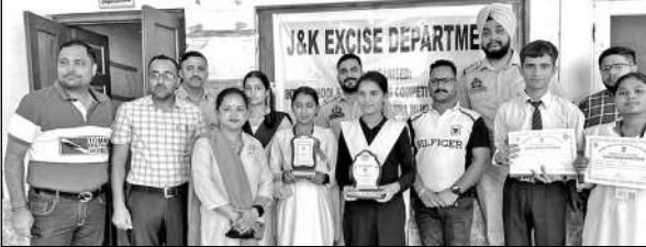
Officials of Excise Deptt along with winner students.

more saplings in their surrounding and collage premises to make it more environmental friendly.