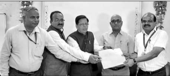
NAAC Peer Team along with GDC Khour faculty.