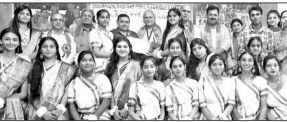
Winners along with organisers posing for photograph.

Speaking on the occasion, The Chief Guest lauded the role of Bharat Vikas Parishad in bringing up the best in the students by