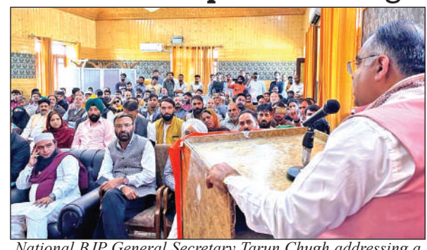
National BJP General Secretary Tarun Chugh addressing a gathering in Srinagar on Monday.

■ STATE TIMES NEWS SRINAGAR: Senior BJP leader and National General Secretary Tarun Chugh on Monday toured north Kashmir and reviewed the arrangements being made for the ensuing visit of Home Minister Amit Shah. Tarun Chugh asked all the party functionaries to gear up for the visit of the Home Minister and carry out awareness programmes about the policies and programmes of the Government for Jammu and Kashmir. He also addressed various delegations and gatherings in the district to highlight the achievements of the Government and benefits