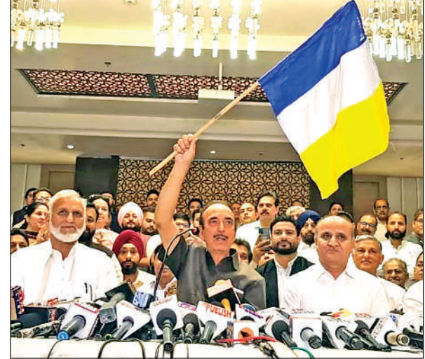
Former J&K CM Ghulam Nabi Azad launching his party 'Democratic Azad Party' in Jammu on Monday.

■ STATE TIMES NEWS JAMMU: Former Jammu and Kashmir Chief Minister Ghulam Nabi Azad on Monday launched his new party the Democratic Azad Party (DAP) - coinciding with the first day of Navratri festival, exactly a month after ending his over five-decade long association with the Congress. Azad, 73, also unveiled the party's flag that has three strips of mustard, white and dark blue colours, and said the priority of the new party will be its registration with the Election Commission, though it will continue its activities because assembly elections in Jammu and Kashmir can be declared anytime. Announcing 50 per cent tickets to youth and women in the next assembly polls, Azad said he will not make the restoration of Article 370 an election issue in Jammu and Kashmir. ■ CONTD ON PAGE 9