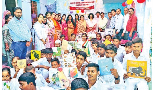
IASOWA J&K members after distributing books and sports articles among students of GMS Dodhi Gujjar Colony.