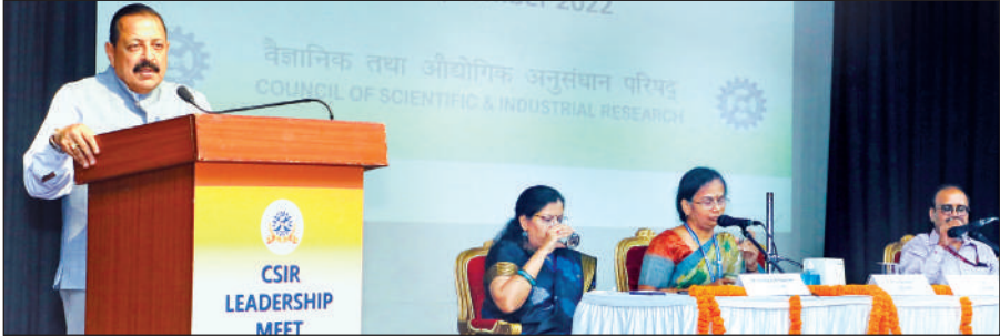
Union Minister and Vice President CSIR, Dr Jitendra Singh addressing the first-ever CSIR Leadership Meet attended by the Directors of all the 37 CSIR institutes from across India, at New Delhi on Monday.

Addressing the first-ever CSIR Leadership Meet attended by the Directors and Head of Departments of all the 37 CSIR labs across the country, Dr Jitendra said, the legacy of CSIR is built on the cumulative contribution of its several national laboratories and institutes. He said, each laboratory of CSIR is unique and specialising in as diverse