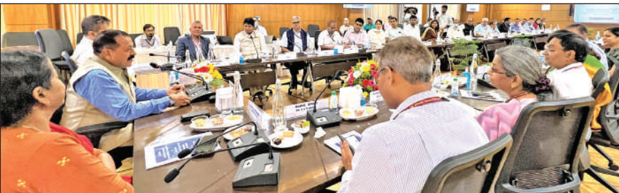
Union Minister Dr Jitendra Singh addressing the Annual Conference of Principal Secretaries of States/UTs Incharge Personnel/ General Administration Department (GAD), at New Delhi on Wednesday.

The Minister solicited the co-operation of the State Governments in completing