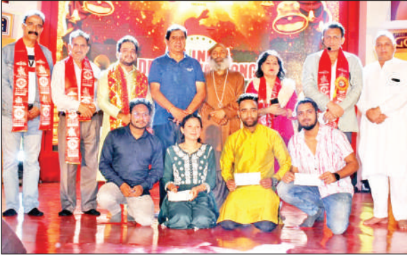
Winner singers posing with dignitaries at Katra.

Wazir, while speaking on the occasion, elaborated that winners of previous mega finals of All India Devotional Song Competition who are lined up