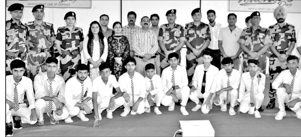
BSF Officers and Jawans along with faculty and students.

■ STATE TIMES NEWS UDHAMPUR: All ranks officers of Border Security Force (BSF) Subsidiary Training Center (STC) Roun Domail celebrated Teacher's Day in various schools in Udhampur. All ranks officers and Jawans visited to Navodaya Vadhalye, Govt. Hr. Sec. School Jaganoop, Govt. High school Ritti, Govt. High schools Roun Domail, Common Public school, Govt. Higher school Sateni, Govt. Hr. Sec. School Barta, Govt. Hr. Sec. School Battal