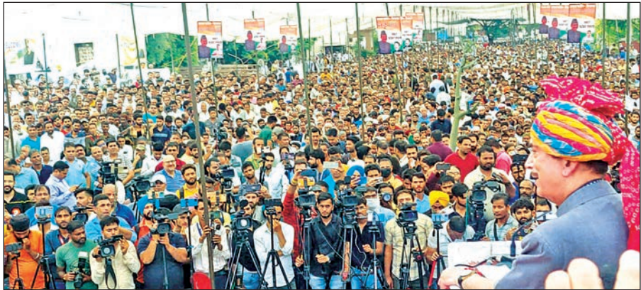
Former Chief Minister Ghulam Nabi Azad addressing a public rally in Jammu on Sunday.

Thousands of his supporters including several former ministers and legislators accorded a warm welcome to