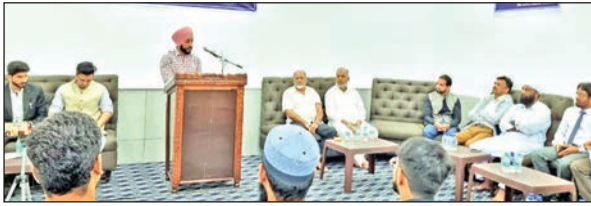
A dignitary speaking at a seminar in Jammu on Sunday.

They stressed upon the youth to become the ambassadors of peace, communal harmony and brotherhood and they should organize interreligious discussions at colleges and university level for better understanding of each other. They said that every religion teaches lessons of humanity, mutual brother-