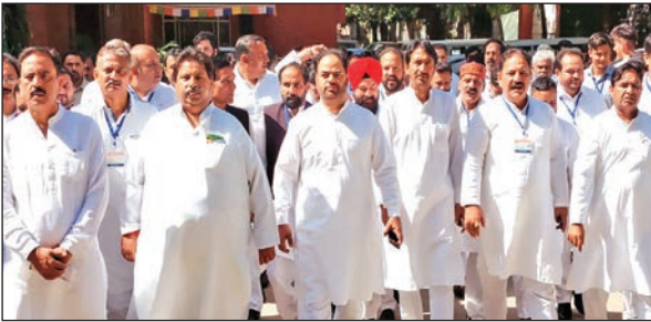
JKPCC leaders taking out rally at New Delhi.