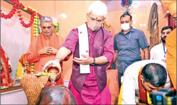
LG Manoj Sinha performing puja at Udasin Acharya Bhagwan Shri Chandraji Maharaj Temple in Srinagar.