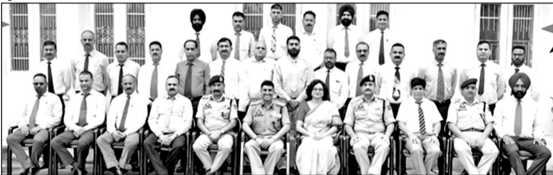
Participant officials along with SKPA officers.