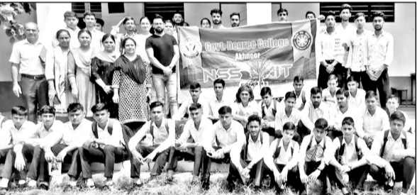
Faculty along with students during the event.