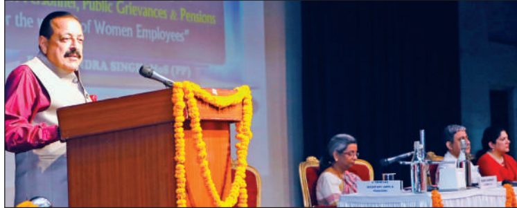
Union Minister Dr Jitendra Singh addressing women officers of Govt of India after releasing a compilation book on major governance reforms related to women employees introduced since 2014, at New Delhi.

three days back, DoPT had taken a historic decision to grant a 60-day special maternity leave for women Central government employees in case of Still Birth or death of an infant within a few days of birth. This was not only a woman-friendly decision, but a humane decision taken with a lot of sensitive precision.