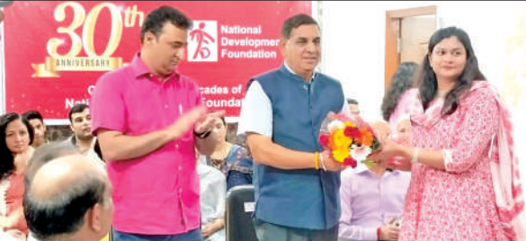
Mayor Jammu, Chander Mohan Gupta being welcomed in a programme.