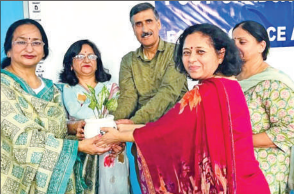
PSPS Govt PG College for Women faculty during an event.