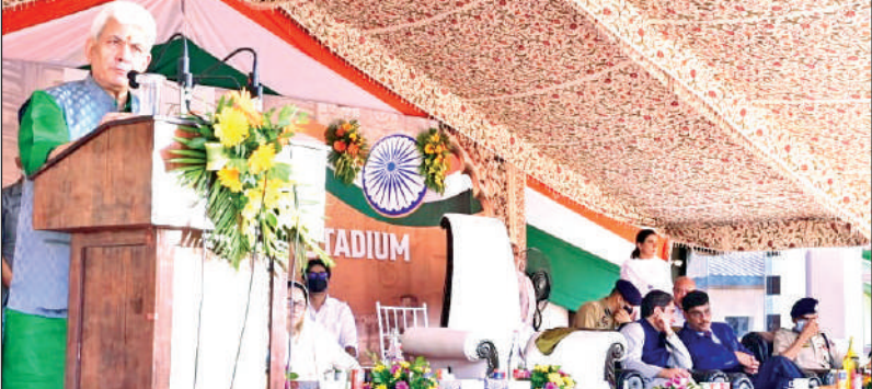
LG Manoj Sinha speaking after inaugurating Ellahi Bagh Indoor Sports Stadium at Downtown Srinagar on Wednesday.