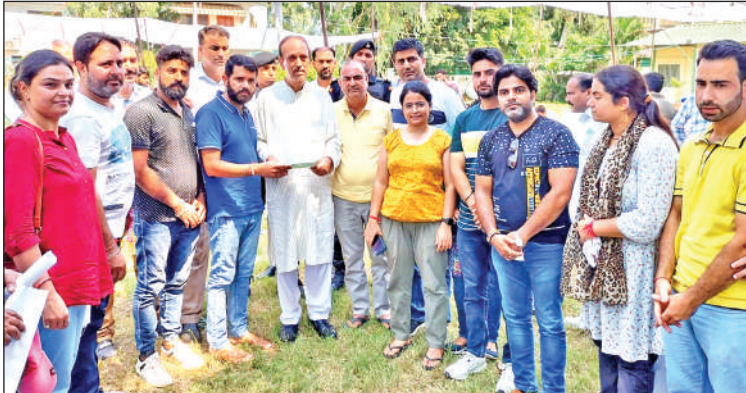
A delegation meeting Former CM Ghulam Nabi Azad at his Gandhi Nagar residence.

JAMMU: A number of delegations called on former Chief Minister Ghulam Nabi Azad on his maiden visit to Jammu & Kashmir after his resignation from Congress party. Apart from addressing a public meeting on his arrival, Azad met more than 350 delegations cutting across region, religion and sections from all 43 constituencies of Jammu region. The people, from various delegations, who called on Azad, extended full support in all his future endeavours. A deputation of All Migrant (Displaced) Employees Association Kashmir (AMEAK) also called on Ghulam Nabi Azad and submitted a memorandum of demands, highlight their genuine demands which are pending for a long time. The members briefed the leaders that KP employees posted in valley are on indefinite protest from last 116 days