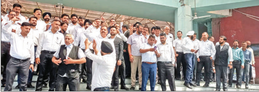
Lawyers raising slogans during a protest at court complex, Jammu on Wednesday.

■ STATE TIMES NEWS JAMMU: The lawyers held demonstration within the Janipur Jammu Court Complex on Friday in support of their demand for construction of multi storeyed building in Janipur Court Complex.