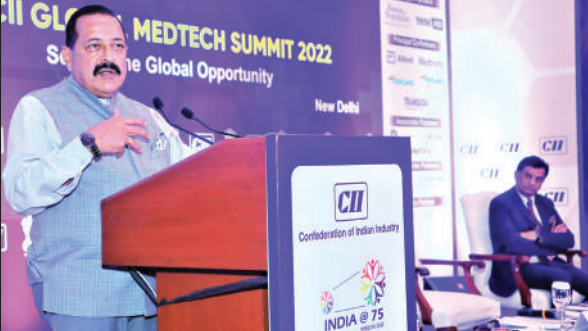
Union Minister Dr Jitendra Singh addressing CII Global MedTech Summit titled "Seizing the Global Opportunity", at New Delhi on Wednesday.

■ STATE TIMES NEWS NEW DELHI, Sep 7: Union Minister of State (Independent Charge) Science & Technology, Minister of State (Independent Charge) Earth Sciences, MoS PMO, Personnel, Public Grievances, Pensions, Atomic Energy and Space, Dr Jitendra Singh today said, India's Healthcare sector is expected to reach $50 Billion by 2025.