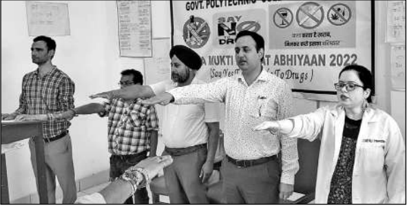
Faculty members taking pledge.