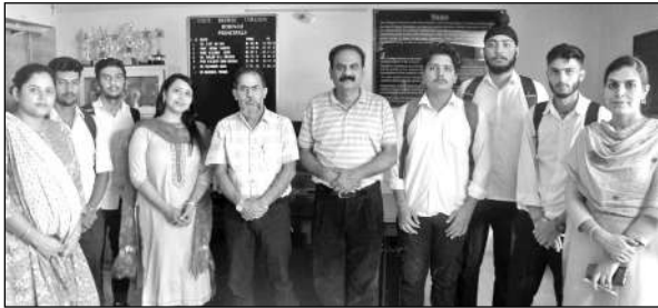
Faculty along with students during the event.