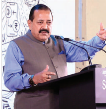
Union Minister Dr Jitendra Singh delivering keynote address at the "Amazon SMBhav Summit" on the theme 'Nurturing Innovation and Entrepreneurship: Paving the Path for Small Business Success' at New Delhi on Thursday.

STATE TIMES NEWS NEW DELHI: Union Minister of State (Independent Charge) Science & Technology; MoS PMO, Personnel, Public Grievances, Pensions, Atomic Energy and Space, Dr Jitendra Singh on Thursday said that e-Commerce platforms can be important enablers for StartUps and MSMEs. Delivering keynote address at the 4th "Amazon SMBhav Summit" on the theme 'Nurturing Innovation and Entrepreneurship: Paving the Path for Small Business Success' here today, Dr Jitendra said, the Micro, Small and Medium Enterprises (MSMEs) are crucial to India's economy as this sector comprises ancillary units, thereby contributing enormously to the overall industrial development of the country. These enterprises are engaged in the production, manufacturing and processing of goods and commodities. The Minister said, "All this is eventually going to take us step forward in the direction of Ease of Doing Business, particularly for the MSMEs, which are the greatest stakeholders and the potential beneficiaries". The MSMEs constitute the backbone of India's economy, contributing around 30% of India's GDP, and creating employment opportunities for 11 crore Indians. Dr Jitendra Singh said, as India emerges as one of the fastest growing innovation-led economies under the