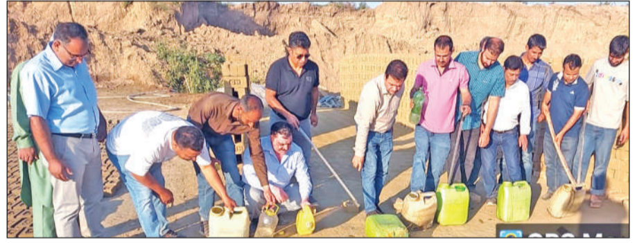
Excise sleuths destroying seized Lahan from Brick Kilns at Budgam.