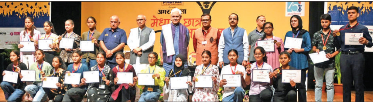
Lt Governor Manoj Sinha felicitating meritorious students of class 10th and 12th at Medhavi Chhatra Samman Samaroh being organized by Amar Ujala Group in Jammu on Monday.